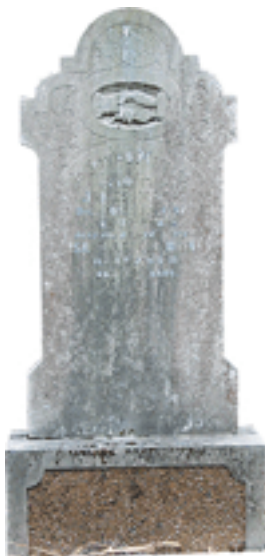
Block 12A Plot 1

Details from the epitaph such as an accident, a person's occupation or war involvement