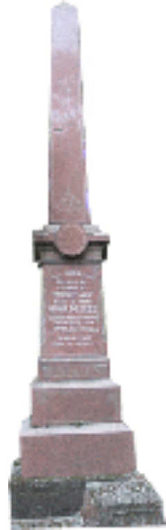
Block 12A Plot 9

Details from the epitaph such as an accident, a person’s occupation or war involvement