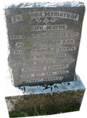
Block 12A Plot 2

Details from the epitaph such as an accident, a person's occupation or war involvement